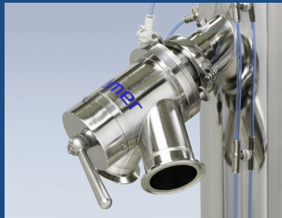
Optional product Diverter KV2010