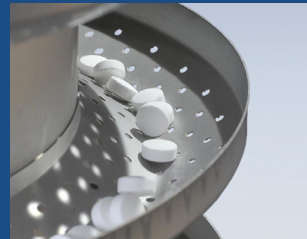
Various helix surfaces available on request as an option