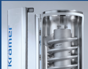
Pivoting and fully removable Window